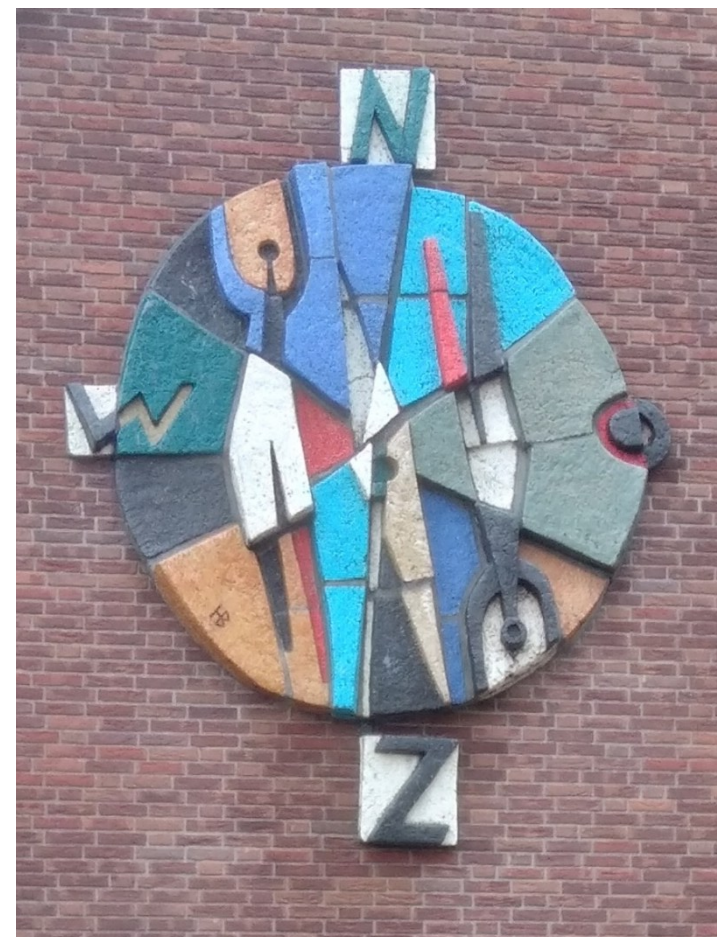
Wijkcommissie Kerkakkers, your compass in the neighbourhood