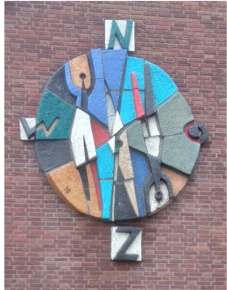
Wijkcommissie Kerkkackers, Your compass in the neighbourhood